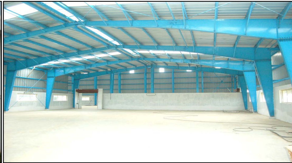
Production Hall: Height 24', Area 7,200 sq ft